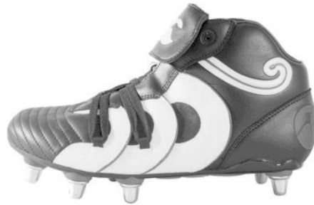
Figure 4: Canterbury of New Zealand, Moko rugby boot, 2001.

within the local market or an exoticness or recognition of the formal appeal of the motif internationally. The company's involvement with an indigenous designer looks to bolster the appropriateness of its use and, furthermore, there is no intention by the company to assert any claim of ownership over the designs or words used (acc. to the Sunday Star Times , 4 Nov. 2001).