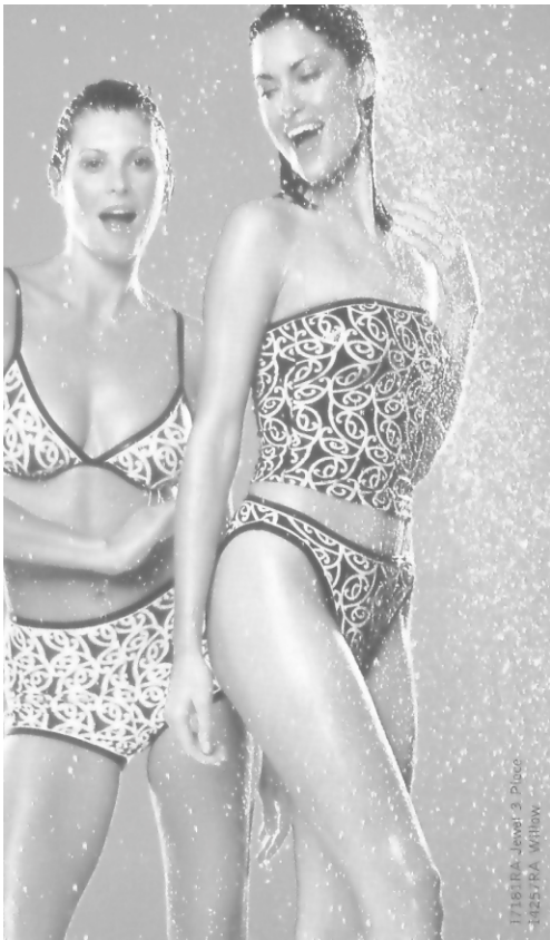
Figure 3: Moontide Swimwear, Jewel 3 piece and Willow from promotional brochure 1999/2000.

press interest for its apparently ethical handling of indigenous interests.